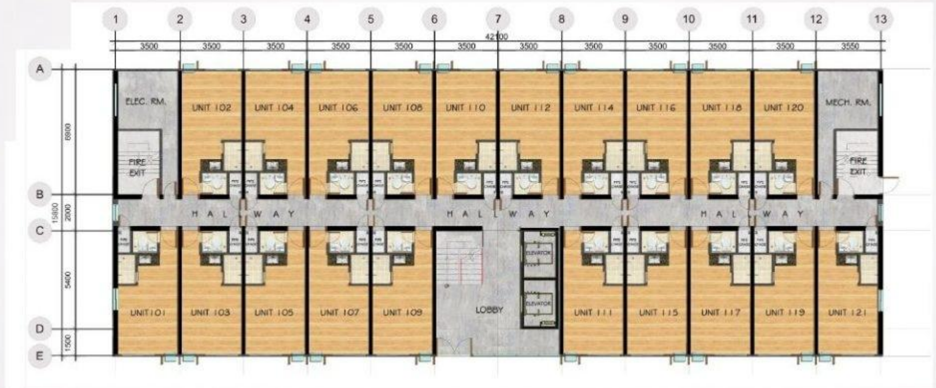
UPPER GROUND FLOOR MRB 1