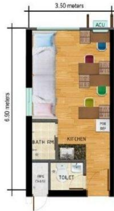
4 BED - DOUBLE DECK